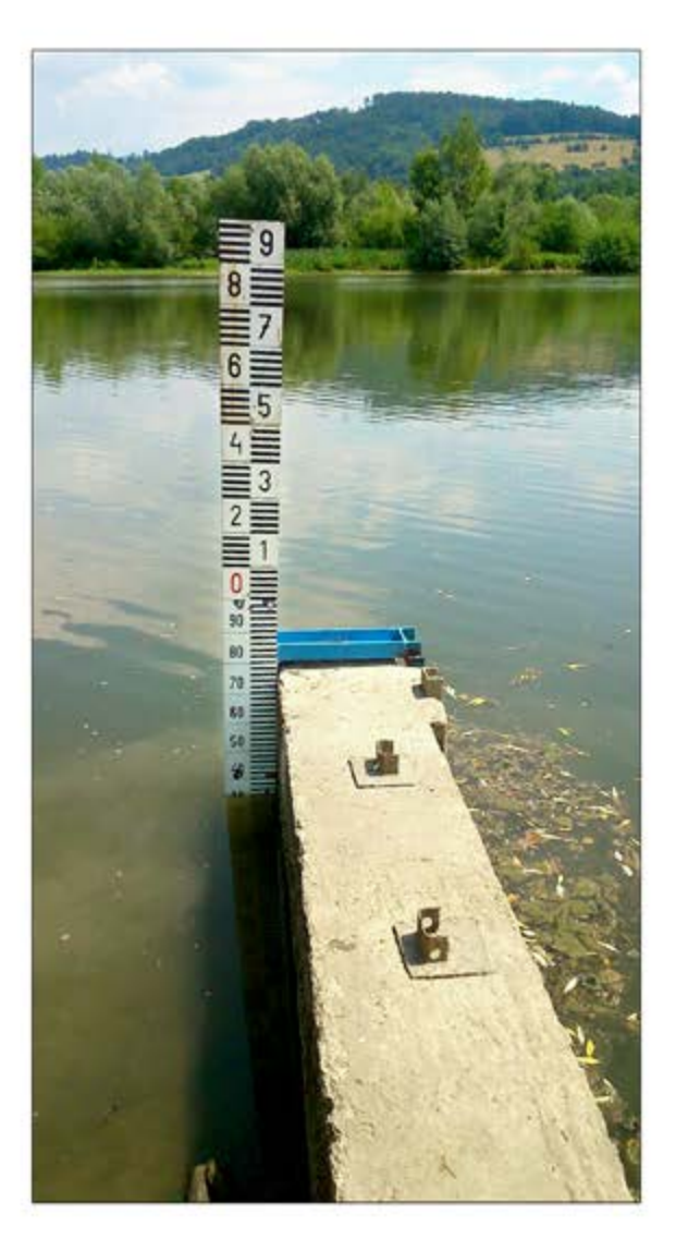
Contractor of geological works:

Ministry of Environment of the Slovak Republic Námestie Ľ. Štúra 1 812 35 Bratislava